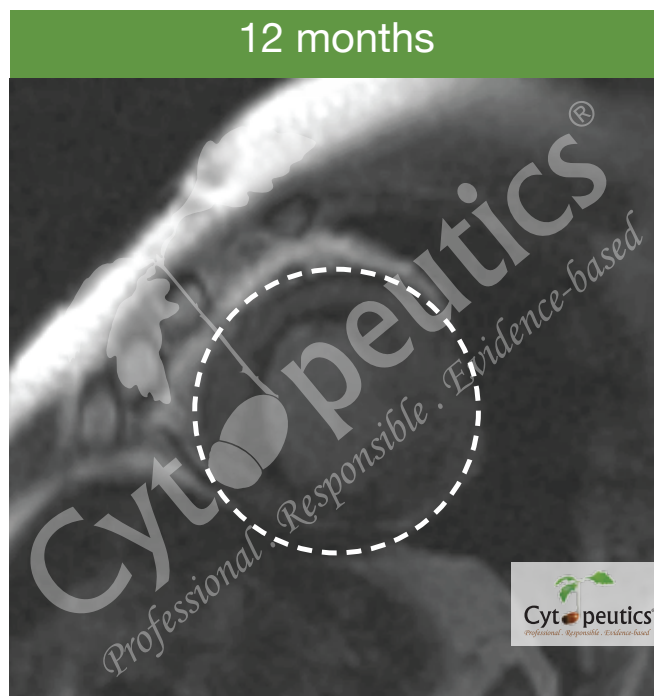
MSC injection results in resolution of scar tissue and increased muscle thickness